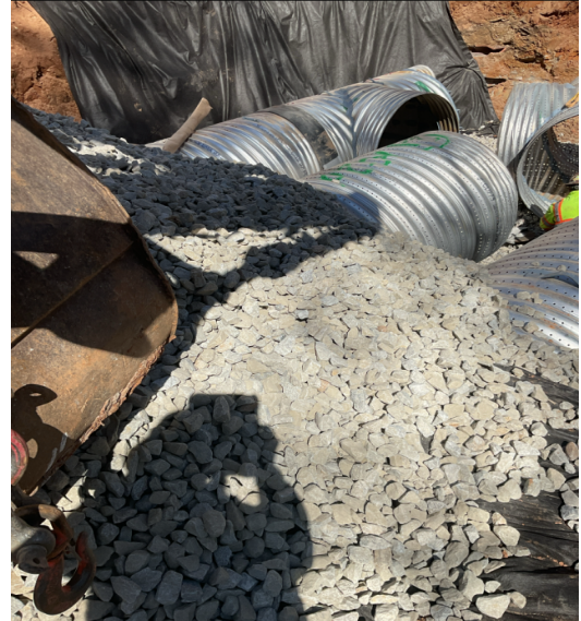
Continue with detention pond install