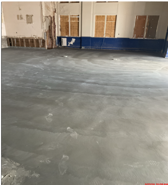
Media Center pour back is complete