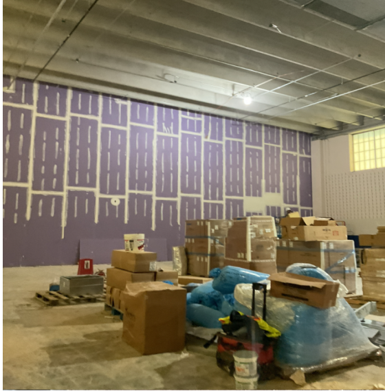
Gym wall is nearing completion, Will begin to apply first coat of paint next week.