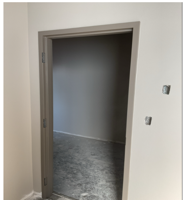
Continue to install hollow metal door frames and begin interior paint work